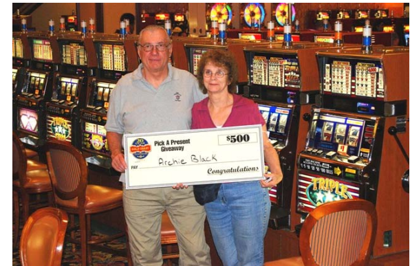
Gold Coast Casino Las Vegas, Nevada