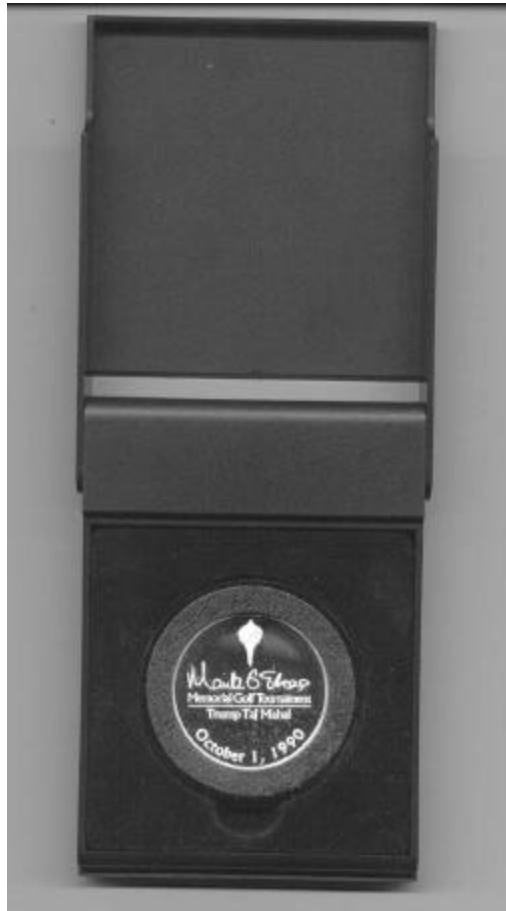
Hinged presentation case

blue insert suede mat. I have assigned a catalog number of M TAJ-0b for this medal in future issues of “Black’s Catalog”.