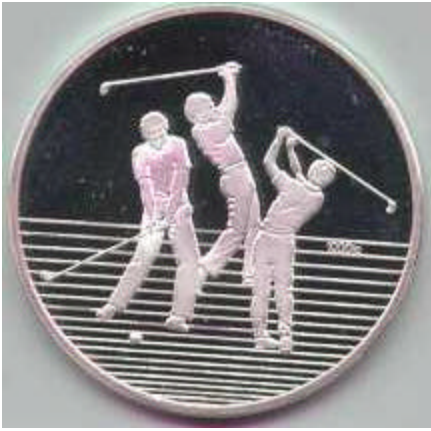
M TAJ-0b (reverse)

These recently discovered beautiful medals are now available at a fixed price of $18@ (plus $2.00 postage) to the rest of my subscribers who are not on-line. The earliest postmark will determine who gets the remainder of these prizes.