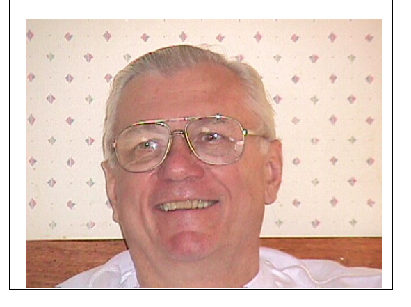
"NO, I'M NOT RUNNING FOR ANYTHING!"

If not, I would be pleased to sponsor you as a new club member. Please email me for a membership application.