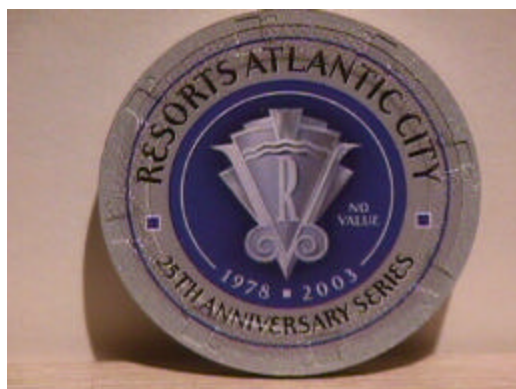
Common reverse side on all chips

While some dates have not been issued yet ... as the contest runs until May ... It would appear that the 1983 and 1988 chips are the toughest dates to locate.