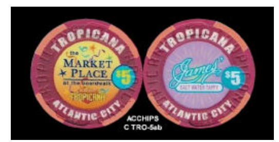
TRO-5ab (LE 500)

FAST FORWARD: On Friday, June 13<sup>th</sup>, Trop issued their 2<sup>nd</sup> chip in the series... James Salt Water Taffy.