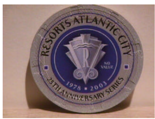
Common reverse side on all chips