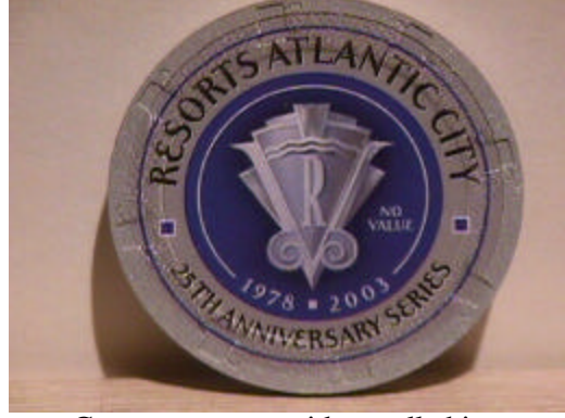
Common reverse side on all chips

If interested, please email me at mailto:ablack2@optonline.net