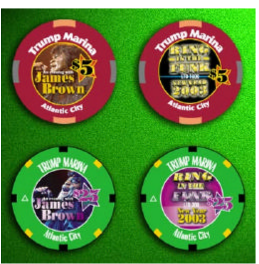
MAR-5y (top) MAR-25i (bottom)