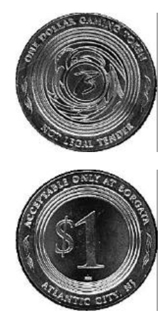
$1, $2, $5 Borgata slot tokens still continue to be extremely difficult to locate as the casino continues to maintain its "tokenless casino" policy.

"BLACK'S ATLANTIC CITY CATALOG" SOLD OUT!!