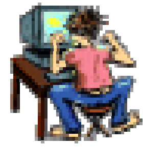
"Working on 2004 Edition"