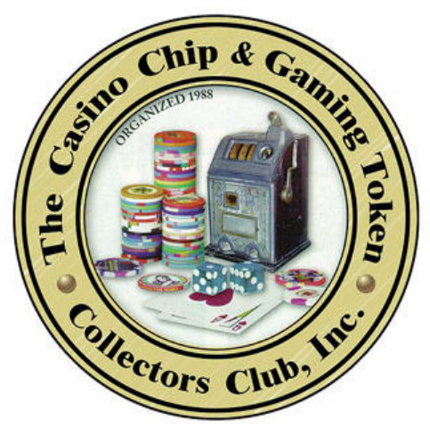
Proud to be .. Honorary Life Member #001