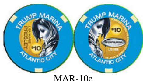
Both chips were issued on October 6<sup>th</sup> .... A double-header!