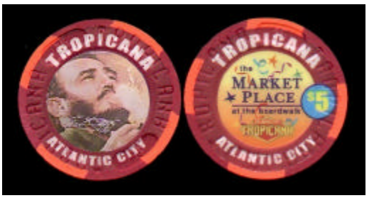
DON'T BET ON IT!

Can a LE Fidel Castro chip be in the works soon??