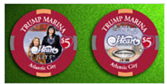
Heart 2003 ... coming soon.