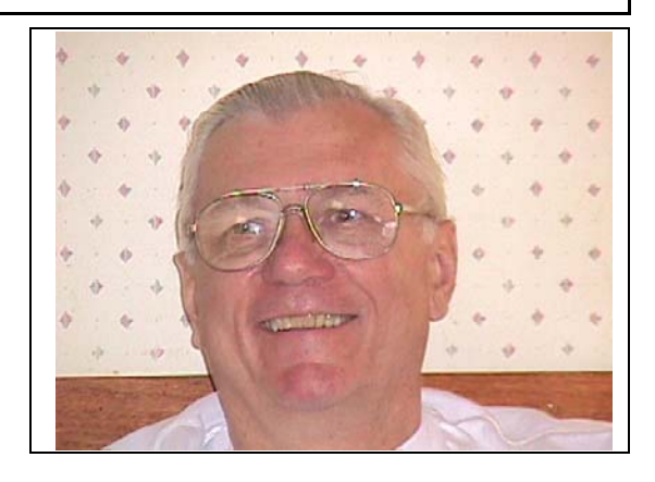
"NO, I'M NOT RUNNING FOR ANYTHING!"