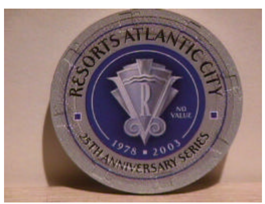
Common reverse side on all chips

While some dates have not been issued yet ... as the contest runs until May ... It would appear that the 1983 and 1988 chips are the toughest dates to locate.