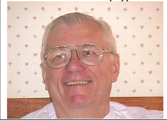
"NO, I'M NOT RUNNING FOR ANYTHING!"

If not, I would be pleased to sponsor you as a new club member. Please email me for a membership application.