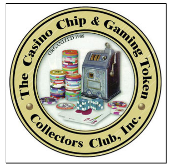
PROUD TO BE HONORARY LIFE MEMBER #001

JULY, 2005 A BUDGET -BUSTING CHIPALANCHE!