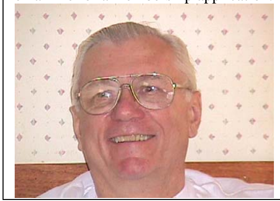
"NO, I'M NOT RUNNING FOR ANYTHING!"

If not, I would be pleased to sponsor you as a new club member. Please email me for a membership application.