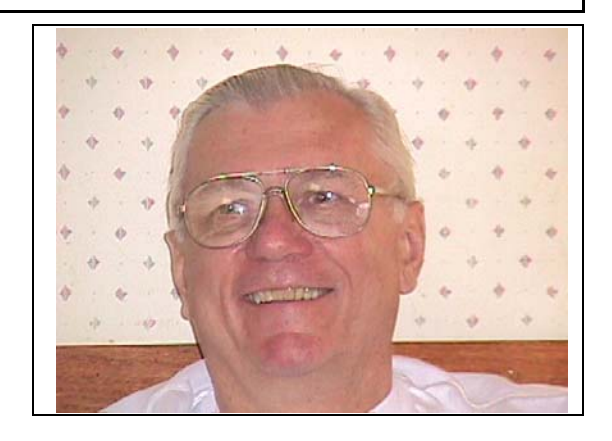
"NO, I'M NOT RUNNING FOR ANYTHING!"

If not, I would be pleased to sponsor you as a new club member. Please email me for a membership application.