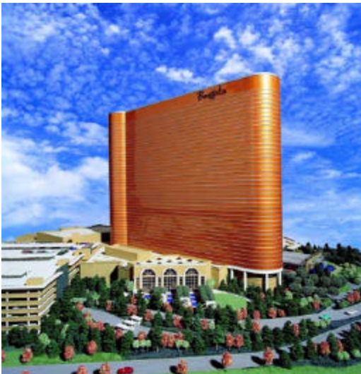
BORGATA HOTEL CASINO

According to a recent news item in The Press of Atlantic City ; Borgata is scheduled to have their “soft opening”