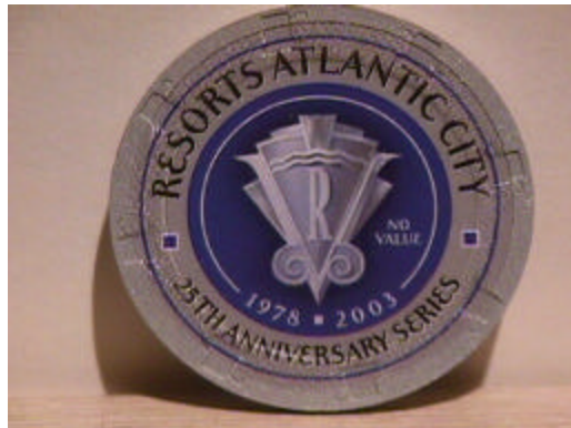
Common reverse side on all chips

While some dates have not been issued yet ... as the contest runs until May ... It would appear that the 1983 and 1988 chips are the toughest dates to locate.