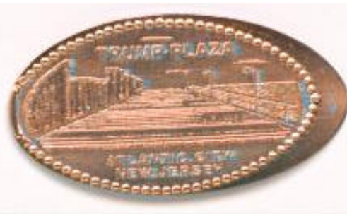
Trump Plaza Elongated Cent