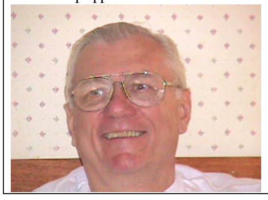
NO, I'M NOT RUNNING FOR ANYTHING! HAPPY COLLECTING ...

If not, I would be pleased to sponsor you. Please email me for a membership application.