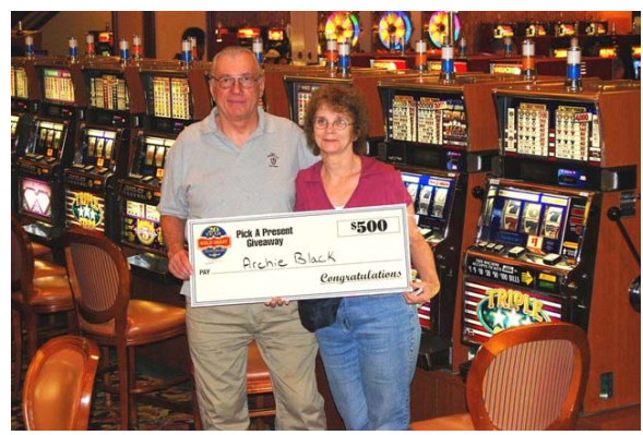
Gold Coast Casino Las Vegas, Nevada

"RETIRED? YES..., BUT NOT RETARDED" Still outspoken on matters concerning the hobby and supportive of our outstanding club!