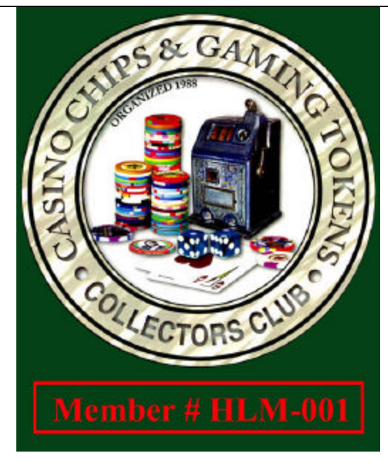
"MORE THAN JUST A CHIP DEALER"

Don't forget to print out a copy of these newsletters if you wish to preserve a copy for future reference.