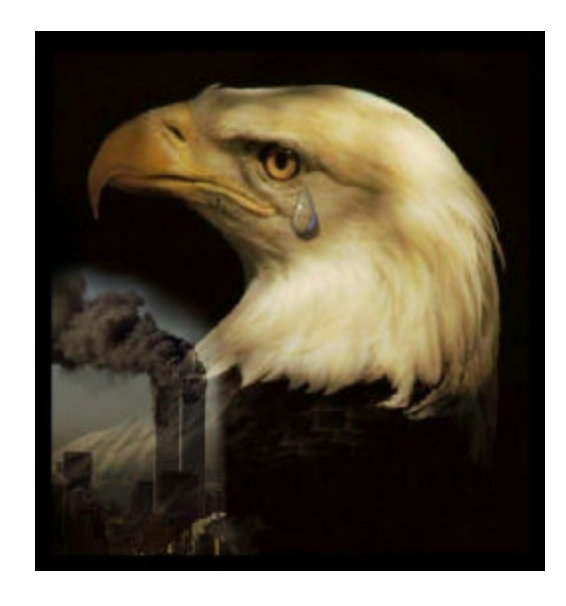
September 11, 2001 ... Never Forget

Don't forget to print out a copy of these newsletters if you wish to preserve a copy for future reference.