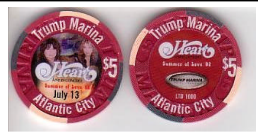
MAR-5v (1000 issued)

Exactly a week to the day, after the T-Games chip was issued, Trump Marina issued their delayed chip commemorating the rock group "Heart" who appeared at the Marina back on July 13th. The usual 1000 chips were ordered, which is becoming standard for Trump Marina new L.E.'s.