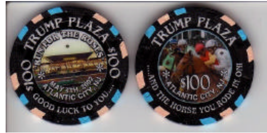
TPP-100c Kentucky Derby chip

Only those who have previously signed up for $100 chips will be receiving this latest LE issued at Trump Plaza. Only 140 of these very limited edition chips were issued to mark the running of this year's Kentucky Derby and I was fortunate to be able to pick up the number of $100's that I did... and to maintain my NI price of $110 each for this extremely limited chip. Sorry ... all sold out.