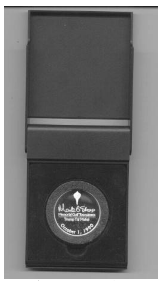
Hinged presentation case

blue insert suede mat. I have assigned a catalog number of M TAJ-0b for this medal in future issues of "Black's Catalog".