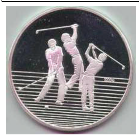
M TAJ-0b (reverse)

These recently discovered beautiful medals are now available at a fixed price of $18@ (plus $2.00 postage) to the rest of my subscribers who are not online. The earliest postmark will determine who gets the remainder of these prizes.