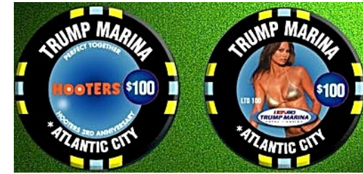
MAR-10t; MAR-25m; MAR-100g